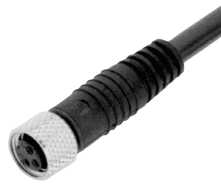
8mm Molded Locking Connector