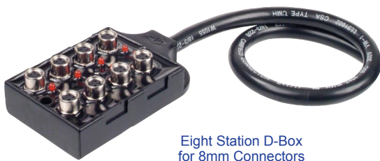
Eight Station D-Box for 8mm Connectors