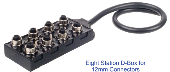
Eight Station D-Box for 12mm Connectors