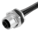
12mm Front Mount Wired