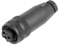
7/8" Straight Field Wireable