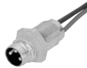
8mm Rear Mount Wired