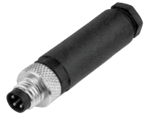
8mm Field Wireable Connector