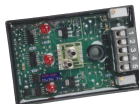
Series EOS 2