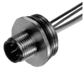
12mm Rear Mount PG 13.5 - 1/2" NPT Wired