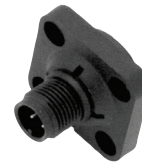
12mm 4 Hole Plate Mount Solder Cups