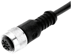
12mm Molded Locking Connector