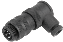
7/8" 90° Field Wireable