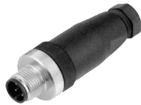
12mm Field Wireable Connector