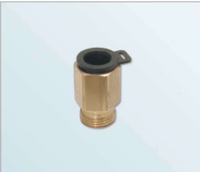
Instant fitting with special seal, for low pressure circuits.