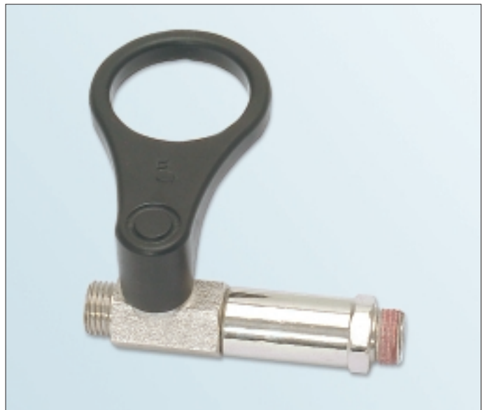
Ball valve handle shape allows manipulation with one hand.