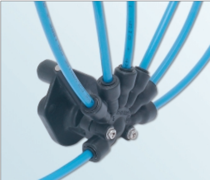
Manifold with push-to-connect parts for oil distribution.