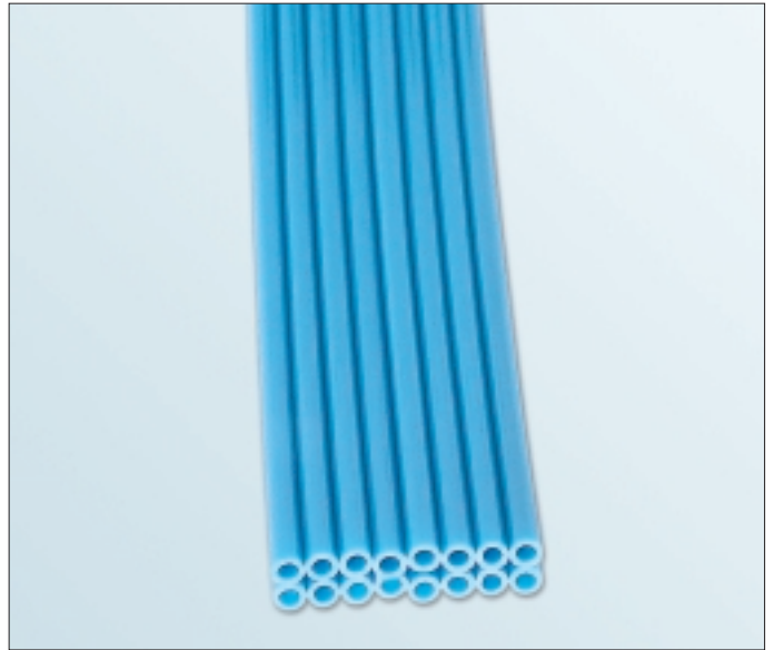
Preassembled polyurethane tubing with 16 outlets for quick installation in many profiles.