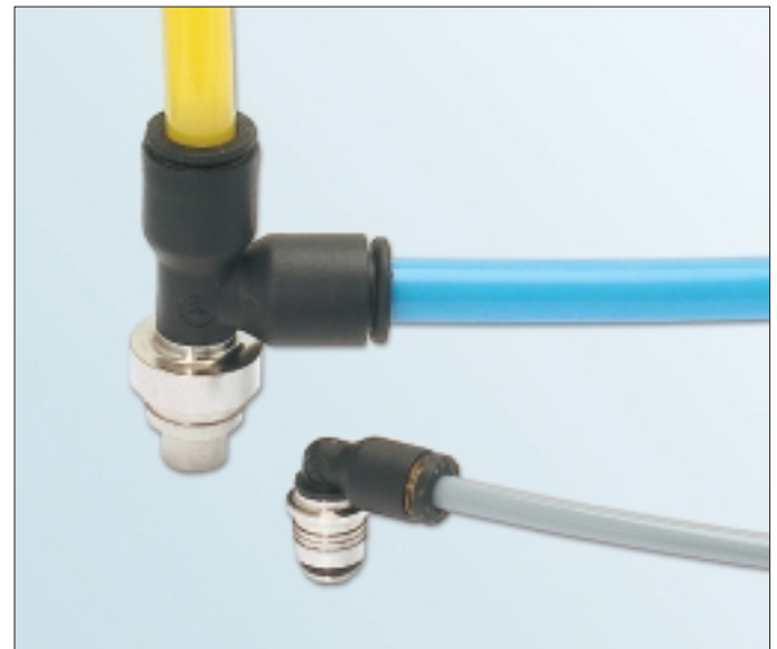
LF3000® instant fittings for connection with close hole centers.