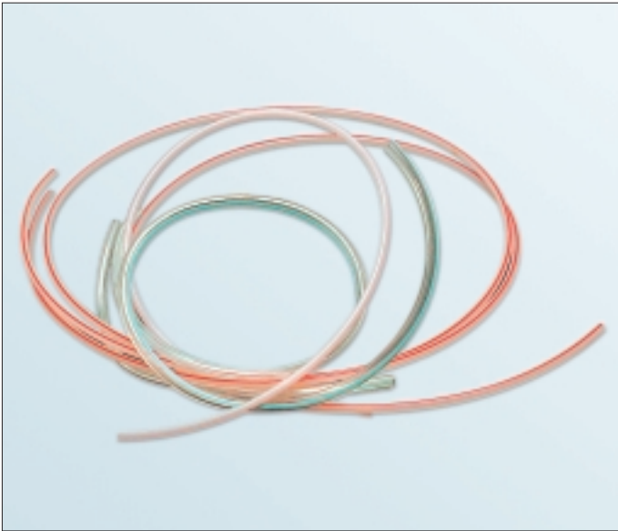
Technical tubes (crystal polyurethane and colorless nylon) marked with a band to allow identification of fluids.